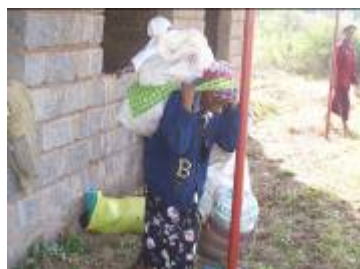
As much as they could each carry home, they did, each bundle comprising of foodstuff and clothing items