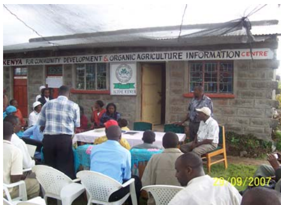
Members had an opportunity to learn about table banking, a field visit at SLIDE-Kenya during the CWG Meeting

PELUM-Kenya participated in Kenya Organic Agriculture Network (KOAN) AGM held in March at ICIPE. During the AGM PELUM-Kenya was re-elected once again to sit in the KOAN board. PELUM-Kenya and KOAN have collaborated in many areas. KOAN is the national movement for Organic Agriculture in Kenya. Its is also the Custodian of Kenyan and East Africa Organic Trade mark certification. PELUM-Kenya members are urged to join this national movement! KOAN is also linked to International Federation for Organic Farming (IFOAM) an Organization whom PELUM-Kenya is also a member