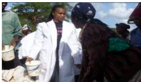
PELUM Kenya was represented by the Research and information Management (RIM) Program officer

There were thousands of Internally Displaced Persons (IDPs) in the first quarter of 2008. Some of these traced and found their way to ancestral land in Central province. In Gatuanyaga location, of Thika municipality division of Thika district; SACDEP Kenya in the goodwill efforts to assist these people sourced food and clothing items as well as some few toilettries.. The IDPs in Gatuanyaga have fortunately been hosted by other resident families and so the foodstuff given is to supplement for the bigger family size. On 6 th March 2006, PELUM Kenya was part of this noble gesture and accompanied SACDEP where the group was gathered at Kilimambogo accompanied by the civic leaders. The foodstuffs & clothes were shared to them. We hope these people will find something to enable them earn a decent living.