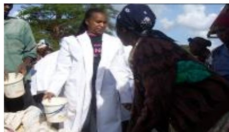
PELUM Kenya was represented by the Research and information Management (RIM) Program officer

There were thousands of Internally Displaced Persons (IDPs) in the first quarter of 2008. Some of these traced and found their way to ancestral land in Central province. In Gatuanyaga location, of Thika municipality division of Thika district; SACDEP Kenya in the goodwill efforts to assist these people sourced food and clothing items as well as some few toilettries.. The IDPs in Gatuanyaga have fortunately been hosted by other resident families and so the foodstuff given is to supplement for the bigger family size. On 6 th March 2006, PELUM Kenya was part of this noble gesture and accompanied SACDEP where the group was gathered at Kilimambogo accompanied by the civic leaders. The foodstuffs & clothes were shared to them. We hope these people will find something to enable them earn a decent living.