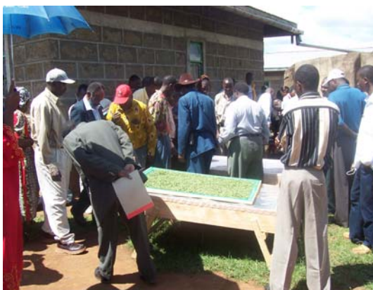
Members inspect a vegetable drier during a field visit at SCODE during PELUM-Kenya AGM

The capacity enhancement program activities were affected by the post election violence which hit most part of the Country in the first quarter. This prompted the postponing of some activities. Among the major activities postponed was the PELUM Annual General Meeting (AGM) which was scheduled for February 2008. PELUM members come from different ethnicity background and therefore it was felt that such a meeting will be very necessary to bring about healing and reconciliation. 3 participants will be invited from each organization. To add more Quality and value, PELUM CWG Meetings will be incorporating field visits to member organizations.