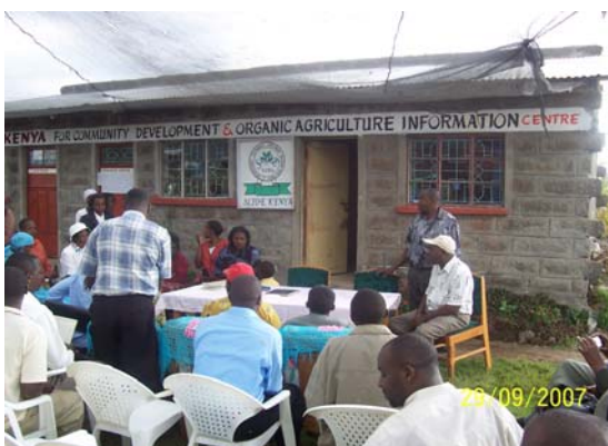
Members had an opportunity to learn about table banking, a field visit at SLIDE-Kenya during the CWG Meeting

PELUM-Kenya participated in Kenya Organic Agriculture Network (KOAN) AGM held in March at ICIPE. During the AGM PELUM-Kenya was re-elected once again to sit in the KOAN board. PELUM-Kenya and KOAN have collaborated in many areas. KOAN is the national movement for Organic Agriculture in Kenya. It is also the Custodian of Kenyan and East Africa Organic Trade mark certification. PELUM-Kenya members are urged to join this national movement! KOAN is also linked to International Federation for Organic Farming (IFOAM) an Organization whom PELUM-Kenya is also a member